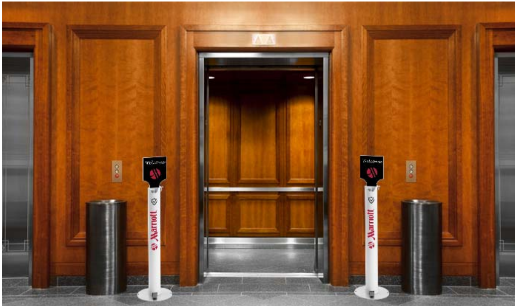
OFFICE & HOSPITALITY